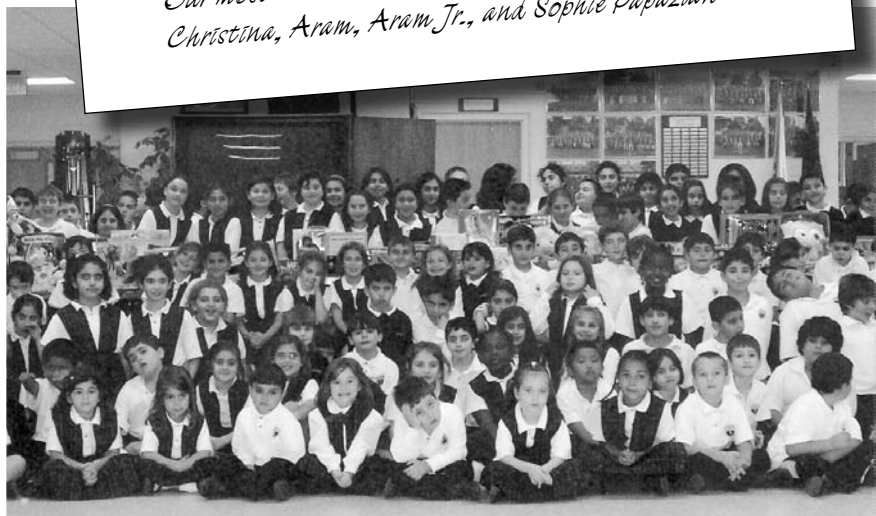
Students donate toys for Armenian orphans' Christmas.