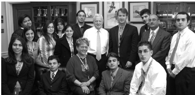
Manoogian students with Congressman Joe Knollenberg in his Capitol Hill office.