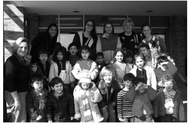
On March 14, Pre-K 3 and 4 attended the Musical Velveteen Rabbit at the Marquis Theatre in Northville, Michigan. The students, parents, and teachers had a wonderful time watching a fabulous cast present the classic tale of how toys become real!