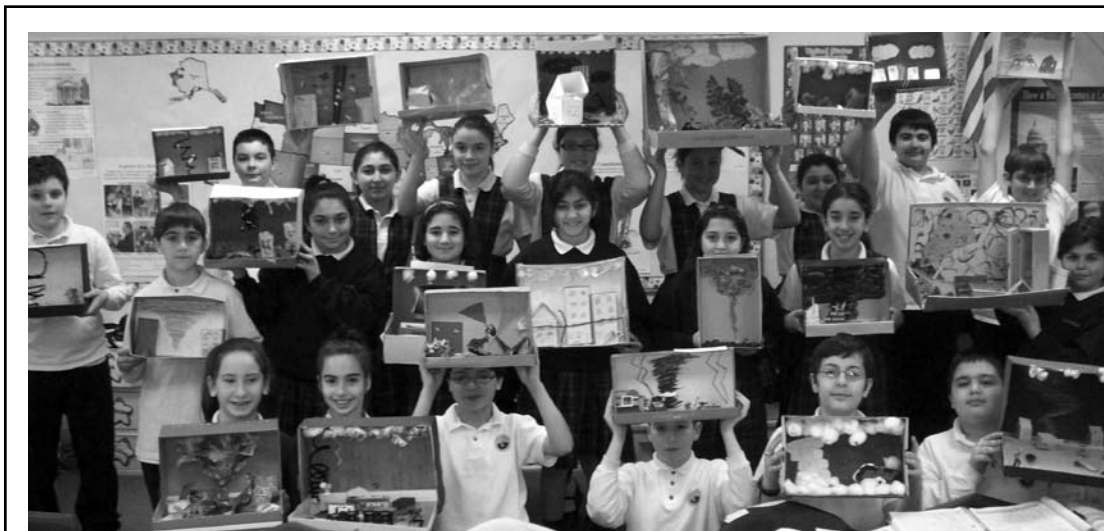
The 5th grade students made natural disaster dioramas about a tornado and a hurricane. This activity was correlated to their reading stories about storms, and the effects of them. They did an exquisite job on these dioramas and put great effort into them. They are on display in the media center.

Remember to Visit Manoogian School's Web Site: www.manoogian.org