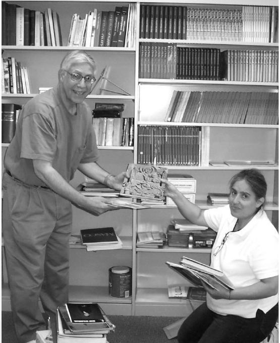
Prior to the 2004-2005 school year staffers hurried to get their classrooms ready for first day of school, September 9.