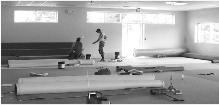
Summer photos of construction at Manoogian show that bulldozers and backhoes gave way to intricate tile and electrical work and rolls and rolls of new carpeting. Work that began in fall of 2003 was completed a full year later.