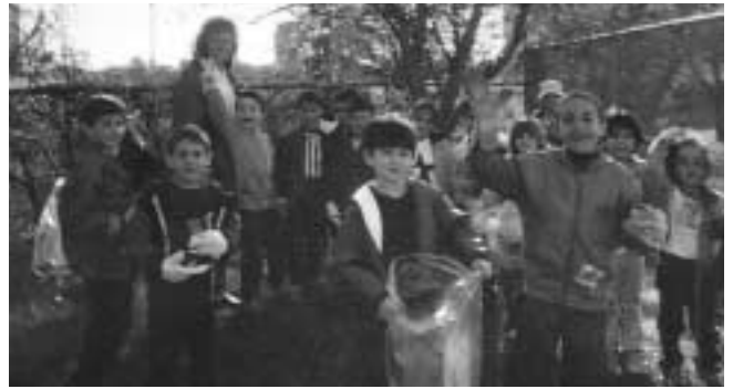
The results were overwhelmingly positive on Earth Day, April 27, when Manoogian School participated in a clean up in conjunction with the City of Southfield. Students cleaned the school grounds, as well as the Northwestern Highway service drive.

Southfield provided two red maples, which were planted on the school's playground. In addition, Southfield's Department of Forestry provided seedlings for each student. Seedlings included cedar, sugar maple, and tulips, which the students were able to take home and plant.