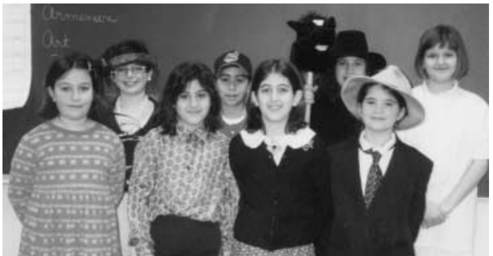
3rd grade students at Manoogian spent February and March learning all about prominent Americans. Each student researched his or her favorite and composed a paragraph summarizing the life of each person. The students were then responsible for putting together an oral presentation, complete with costumes and props. The project was meant to strengthen the students' reading, writing, and research skills, and to help them develop public-speaking poise.